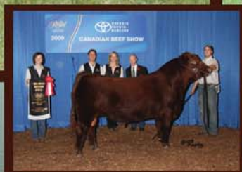
CHAMPION YEARLING BULL ROYAL WINTER FAIR 2009