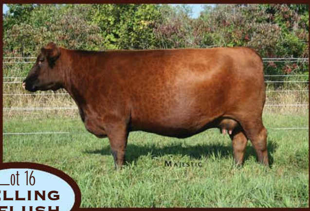
Lot 16 SELLING A FLUSH