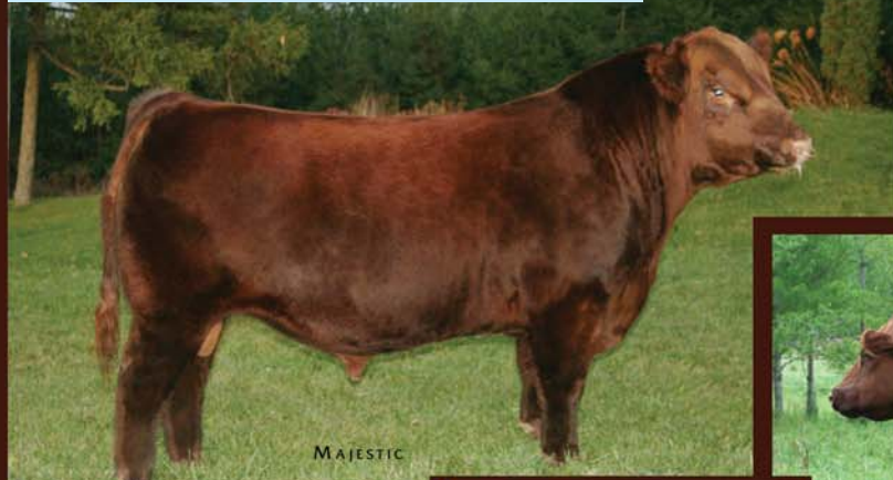
RED MAJESTIC CHIEFTAN R 120U