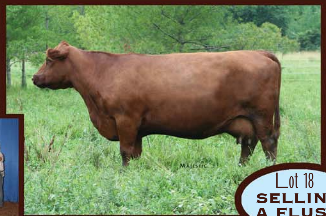
Lot 18 SELLING A FLUSH